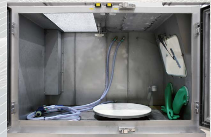
Processing chamber with rotary table